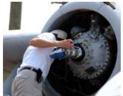
Paul chasing old bird's nests out of the engine.

These little rubber band machines fly over us like 20 times a day at the airport.