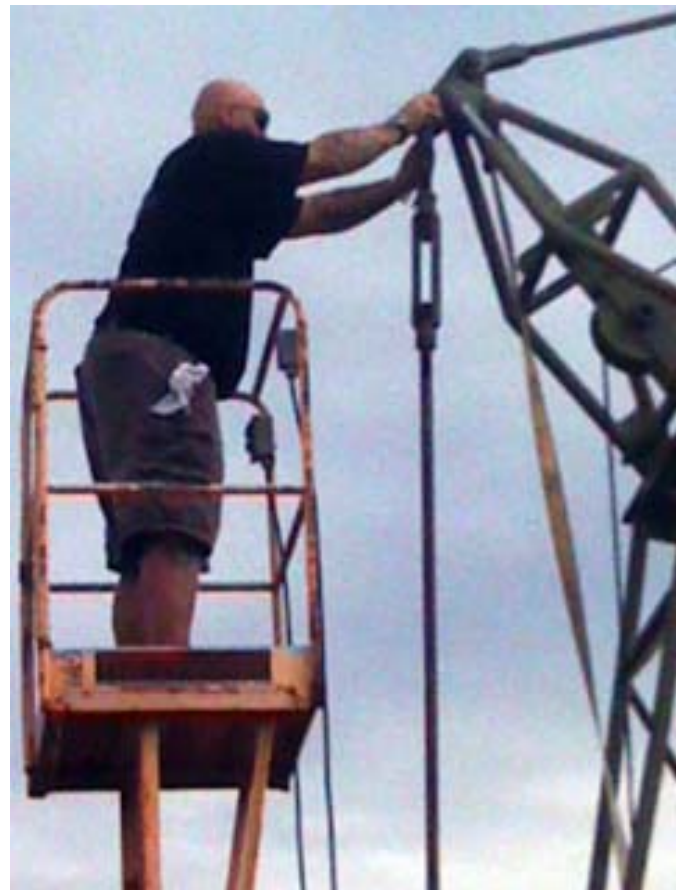
It is lonely at the top.