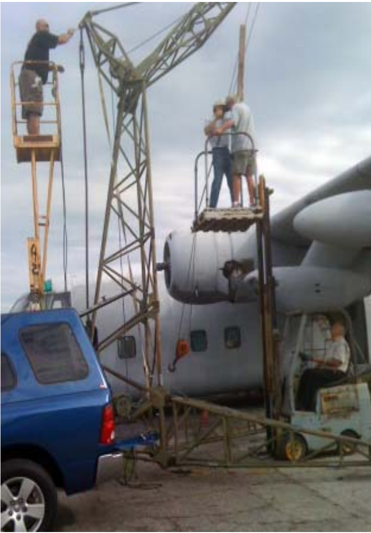
Cal's truck is there for a sense of scale.