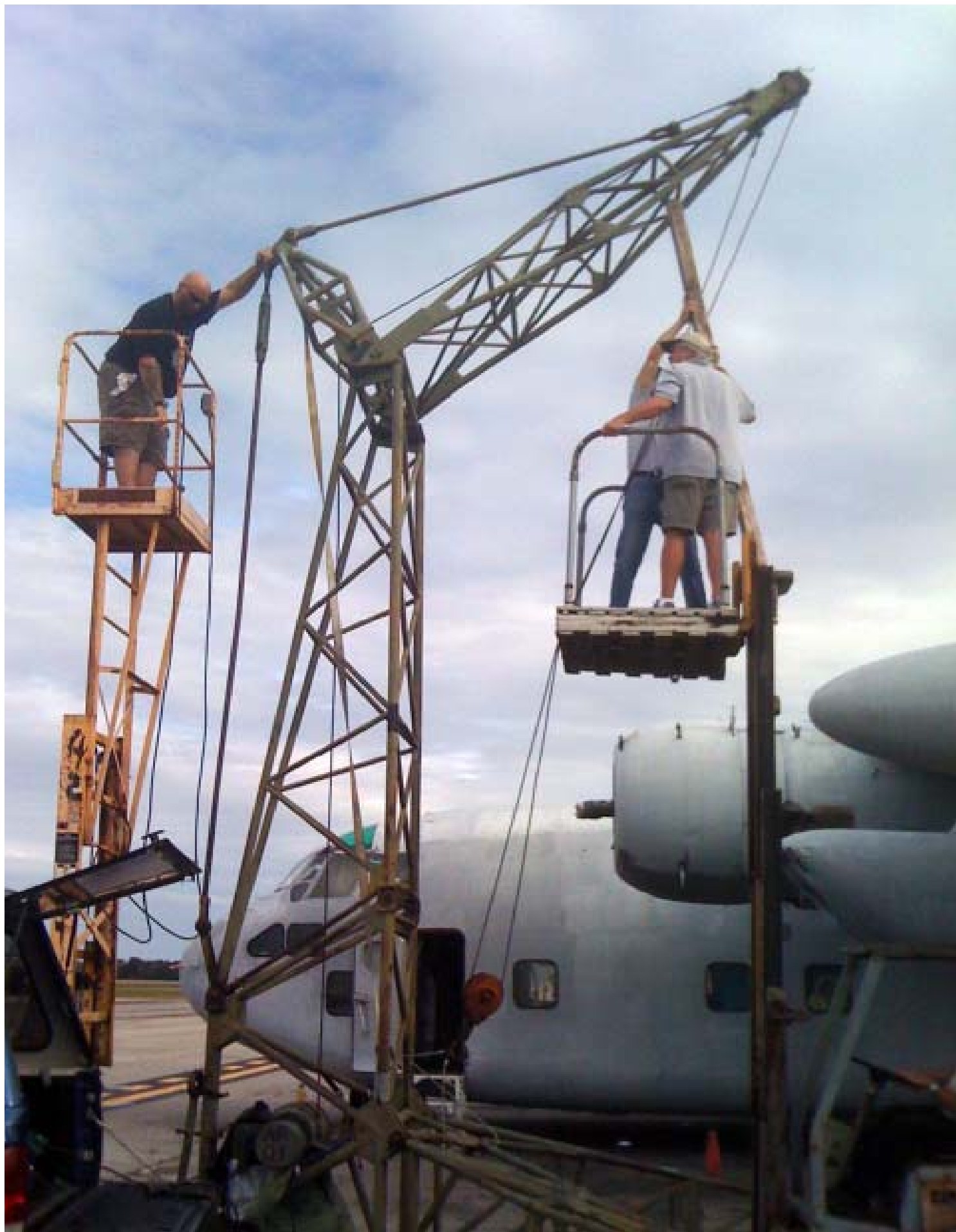
Full page shot for effect!