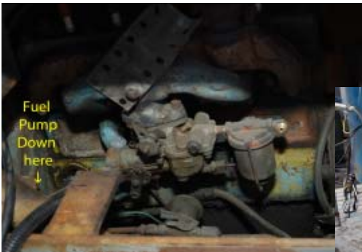
The nasty location of the fuel pump - Not an easy thing to reach.

Here is Weird Neil in Waihekie Island. I only included this because he is loyally wearing his Air America Foundation T-Shirt! Thanks for the photo Neil - Enjoy the view for us.