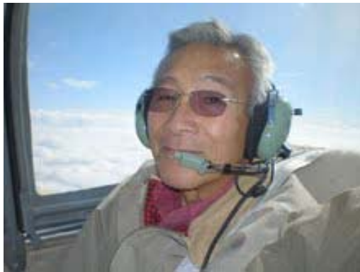
Panya in the T-18W