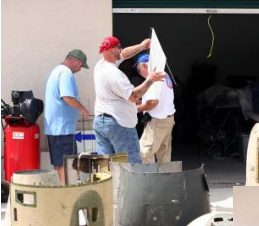
Yours truly checking out old signs and helping to decide what can get chucked out.